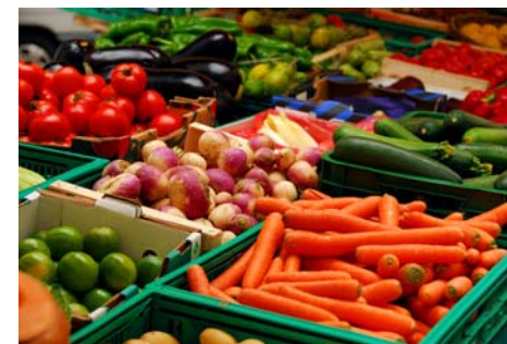
School lunches include fresh fruits and vegetables